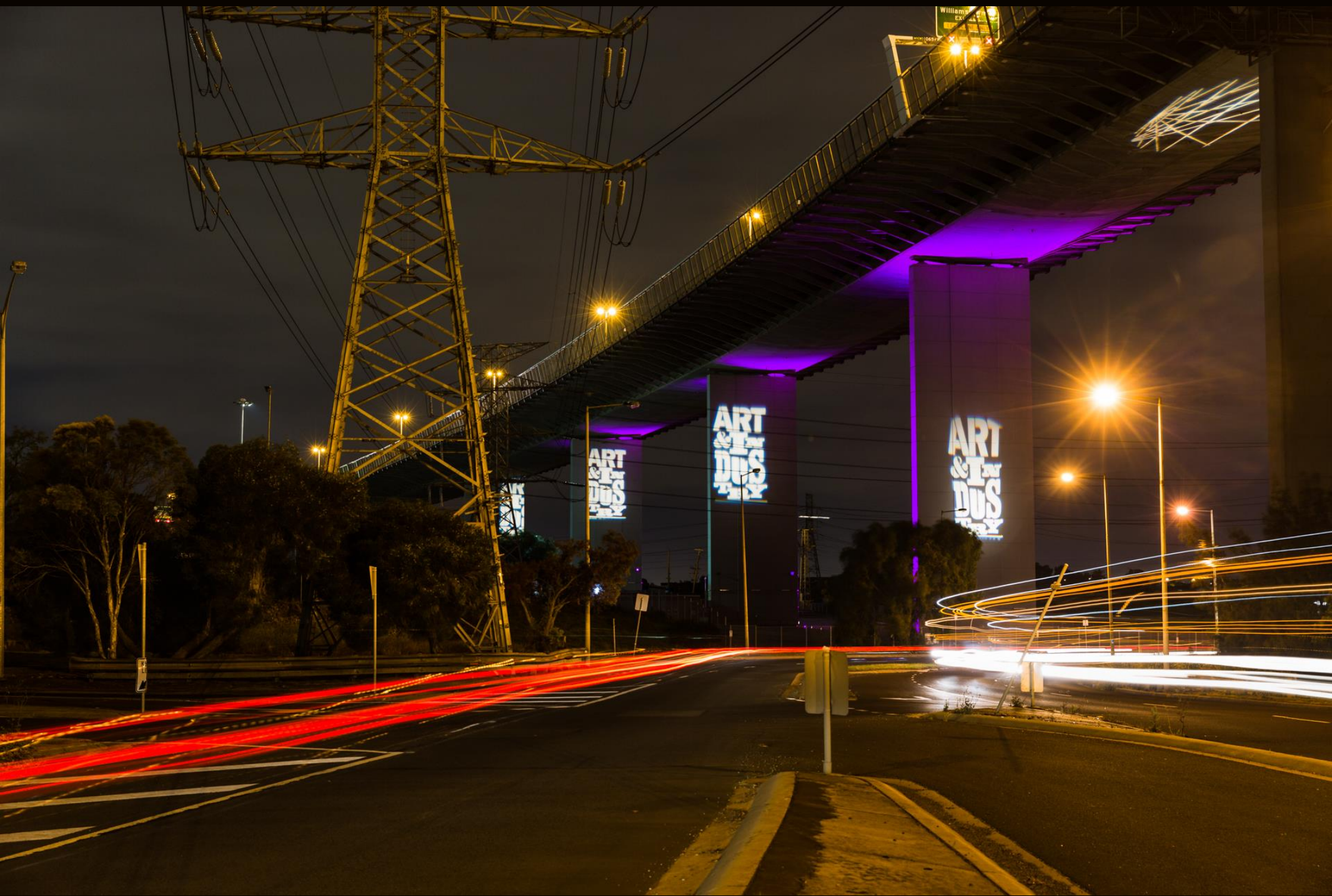
Western Lights 2016: Westgate Bridge