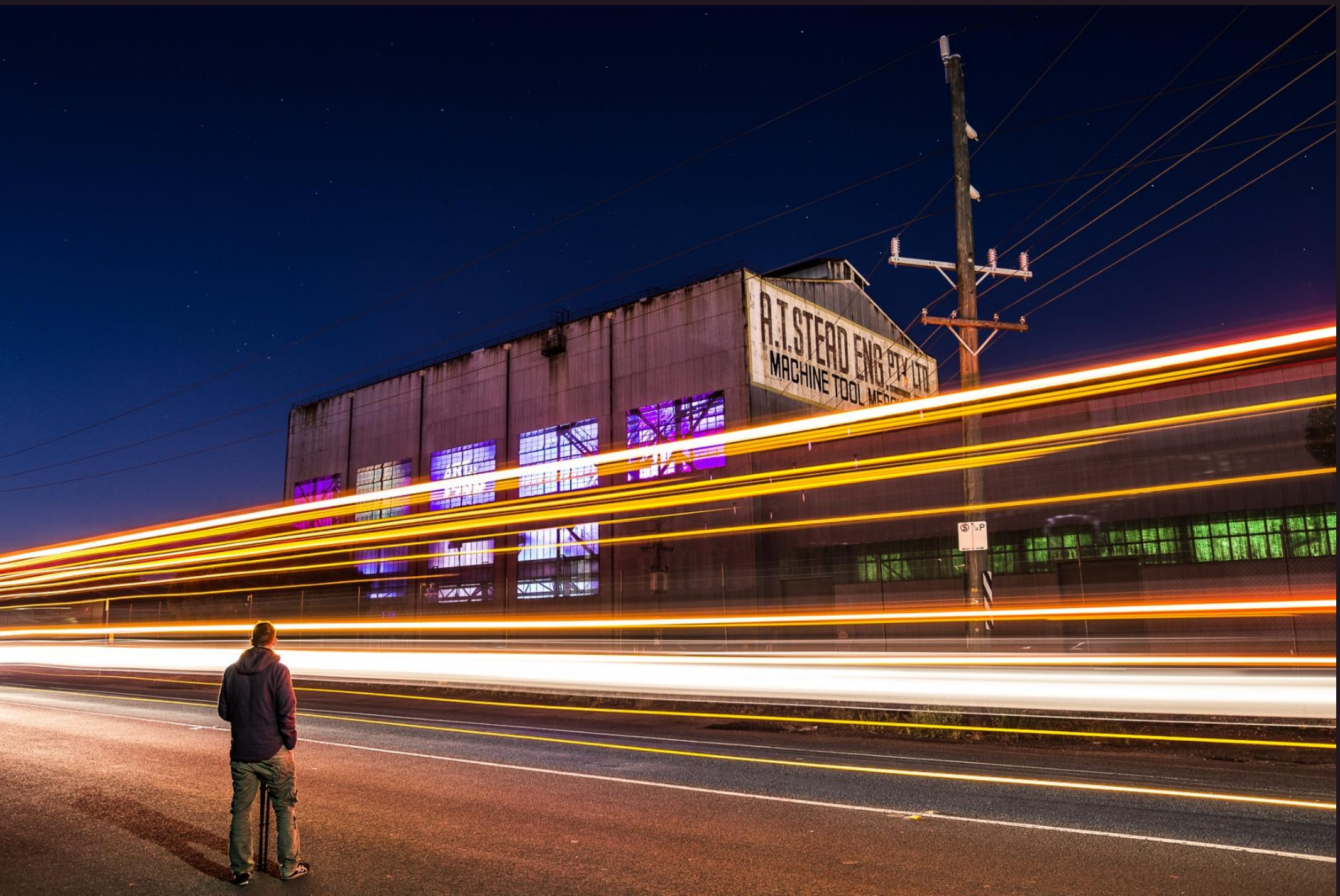
Western Lights 2016: Modscape