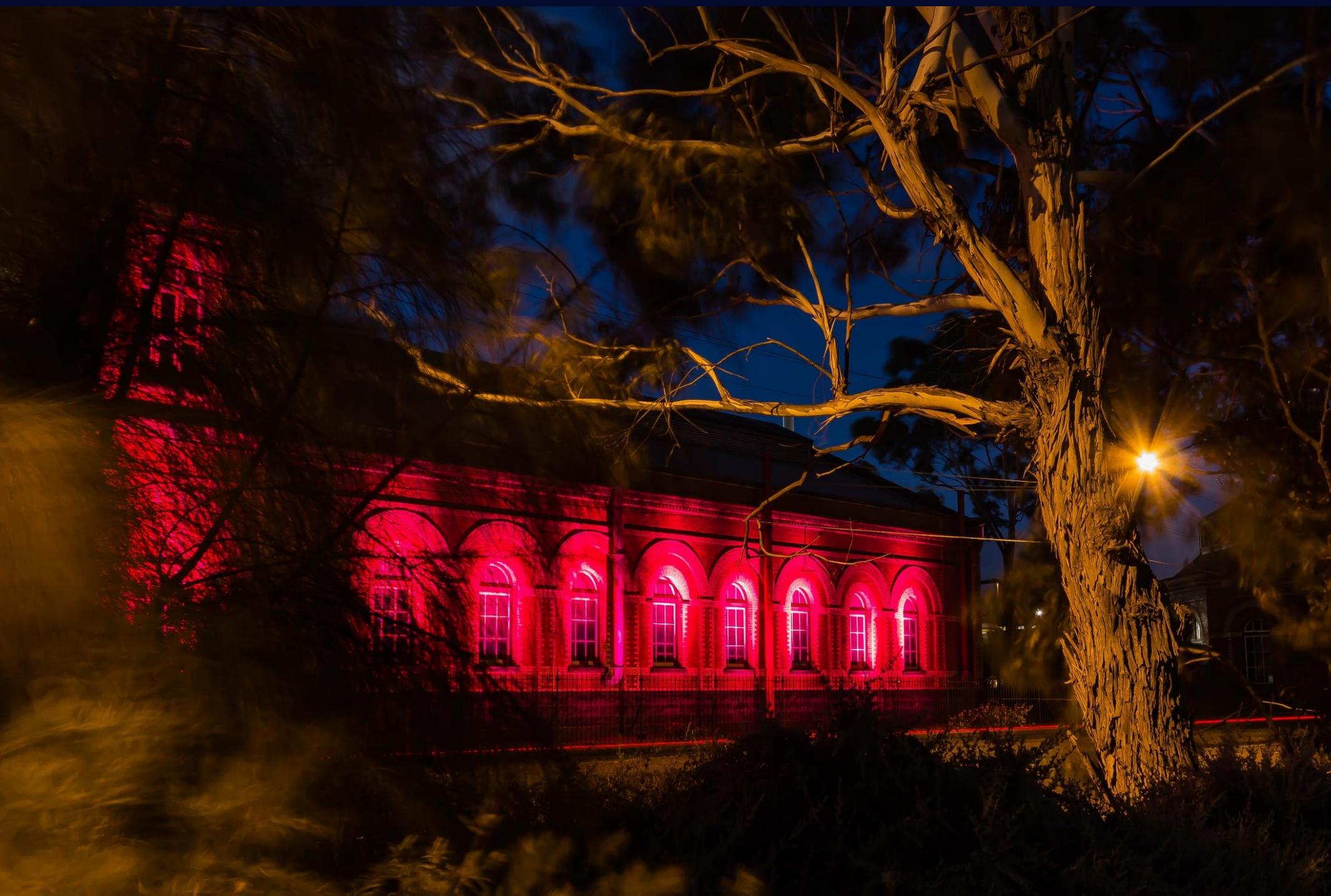
Western Lights 2016: Scienceworks